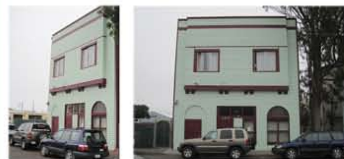
Fresh paint at the Women & Children's Shelter