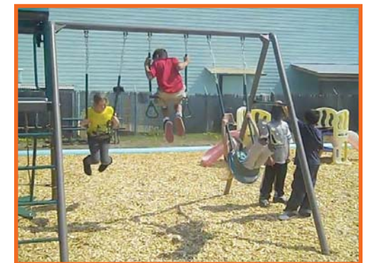
And finally the goal - The sound of happy kids!