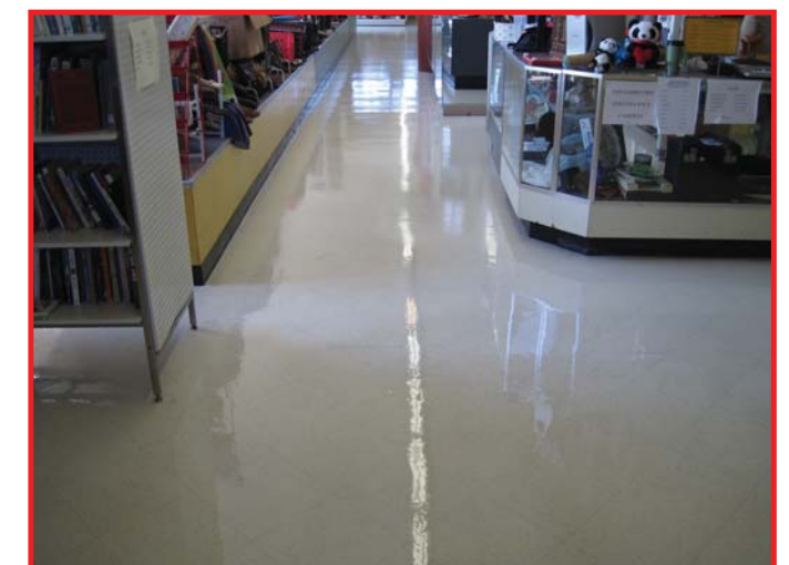
Another job well done! Thank you Men's Program.

Projects like this help the men, in the New Life Program, learn what it means to develop a stable work ethic, which is a valuable asset. We have seen men transition, from living a life of severe drug, and alcohol abuse, into clean, sober, responsible, productive members of society. It is a blessing to work with these men on a daily basis, and to witness the change in their lives.