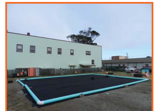
Next came the construction of the playground.