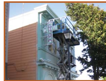
A work in progress - Men's Shelter

We have to admit that the Shelter looked like a typical homeless shelter, but we are proud to say the appearance has changed. A lot of times when you see homeless facilities, they are thought of as not being well kept, but if you can apply a new coat of paint, it's amazing how you can brighten up the facility, and make it look like home. That is exactly what we have done with the Men's Shelter.