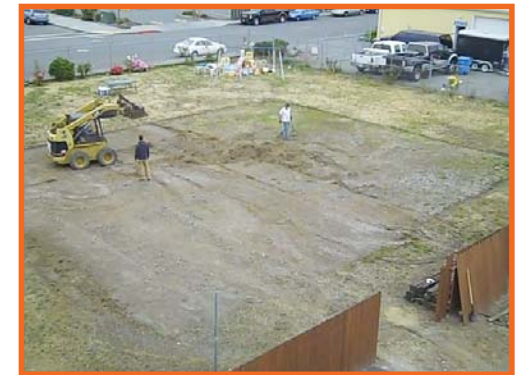
A good foundation was needed first.

We are sure the children were aware we were building them a new playground, and that it would have new play equipment, just for them! The waiting must have been the hardest part for the kids. Just like waiting for Christmas morning to open their presents. When the day finally came, you could hear the wonderful sounds of children running, sliding, and swinging at the new playground. Jesus just loves little children, and I'm sure He's smiling while watching them play in their new playground, on their new play equipment.